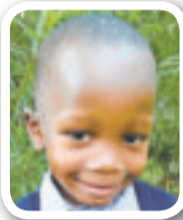
Name: Alex Age: 4 Years Rescued: Lower Kabete